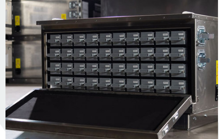
AmeriCase container for lithium-ion backup power, engineered for Data Center environments.

When packaging performs effectively in both mechanical and thermal dimensions, the likelihood of a localized failure transitioning into a cascading loss event is significantly reduced. Containment systems that physically isolate components and regulate heat distribution help prevent one cell's failure from triggering adjacent cells, a critical factor in limiting both the frequency and severity of multi-unit loss scenarios in lithium-ion systems.